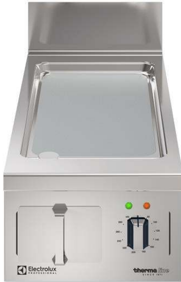
589915 (HCHMBBDODM) Electric Fry Top with smooth Scratch Resistant NitroChrome3 cooking plate, 1 zone, one-side operated with splashback - Marine USPHS (only M2M)